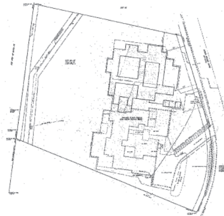
FLOORPLAN & PLAT Visual Aid Only Not to Scale